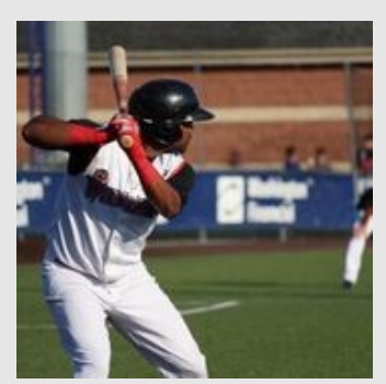
The hitter is going to hit the ball.

The fielder is going to try and catch the ball.